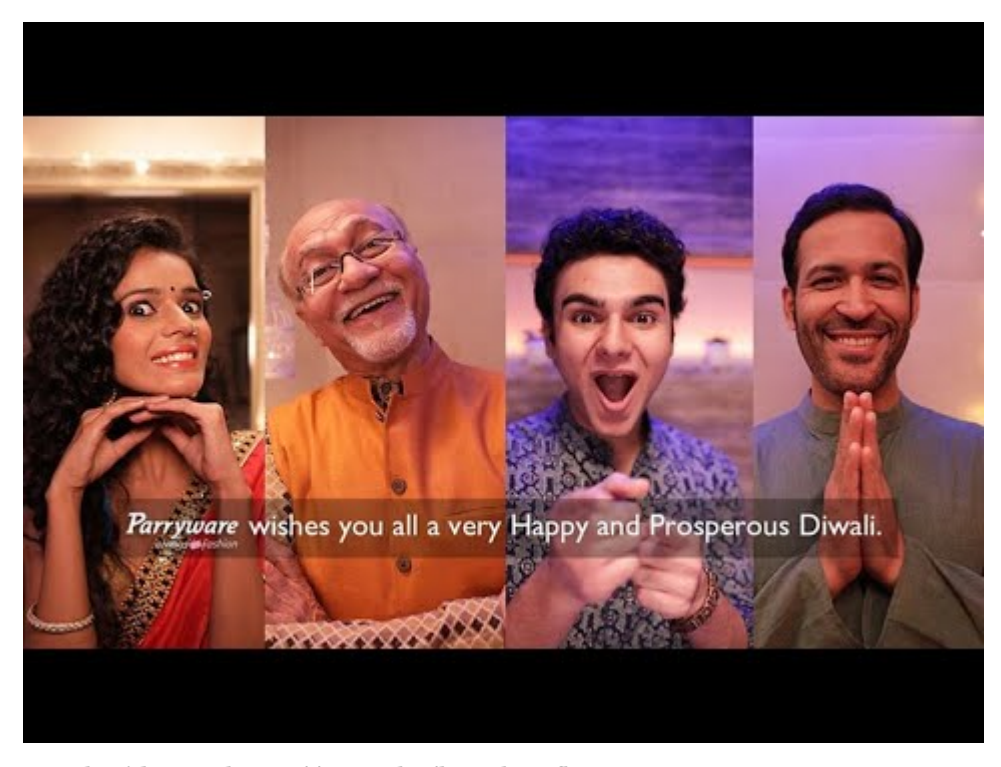
Watch Video At: https://youtu.be/lwBYboHfkCo

Diwali is one festival that brings whole family together. It's an occasion to dress up, celebrate, and indulge in everything one desires. Being one of most awaited and celebrated festival of India, Parryware , India's contemporary bathroom solutions brand released a digital film showcasing people bringing one positive change in their life to celebrate this Diwali in a unique way. The film is followed by a digital contest.